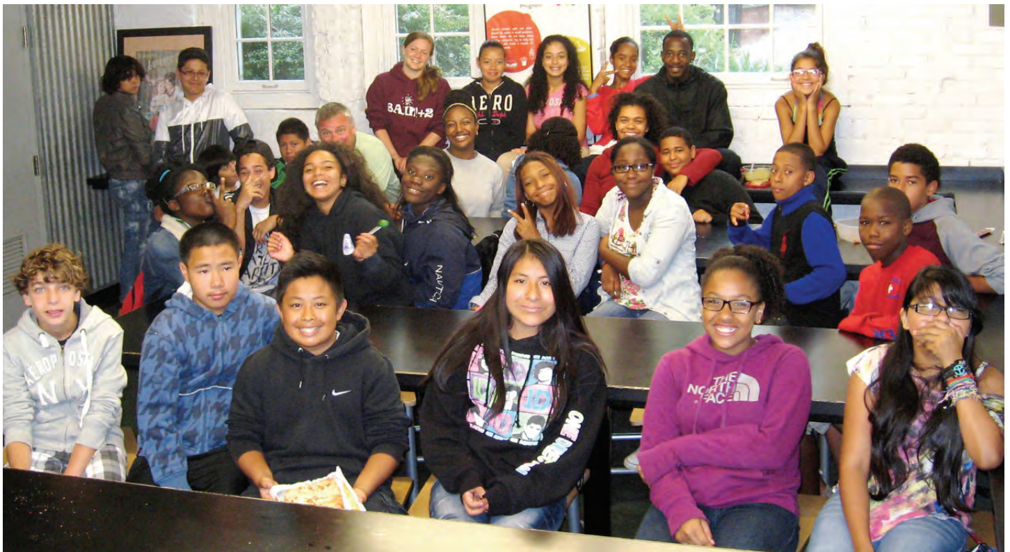
Middle school Crusaders enjoyed a summer full of learning and fun. Above, they get ready for another day of literature, forensics, and videography at Wheeler Summer Program . See more photos inside!

Please keep us notified Have you changed your address or phone number, or has your Crusader changed schools? Call (401) 854-5500 or write to info@thecollegecrusade.org .