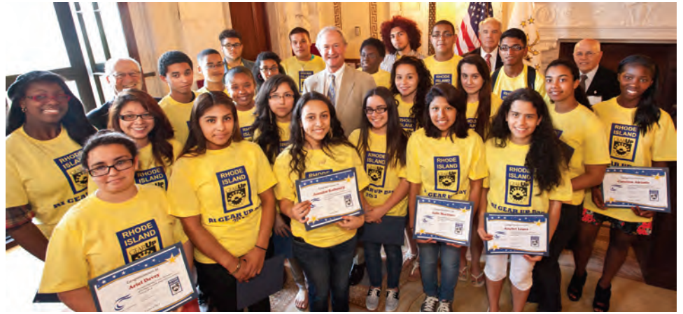
Award-winning high school Crusaders display their certificates with Governor Lincoln Chafee at our GEAR UP Day at the State House event.